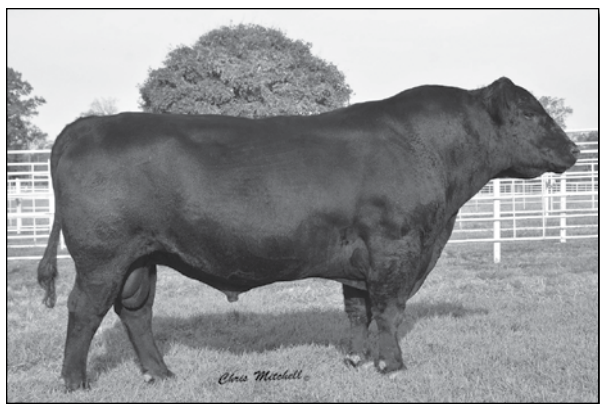
SANDPOINT BUTKUS X797 REFERENCE SIRE