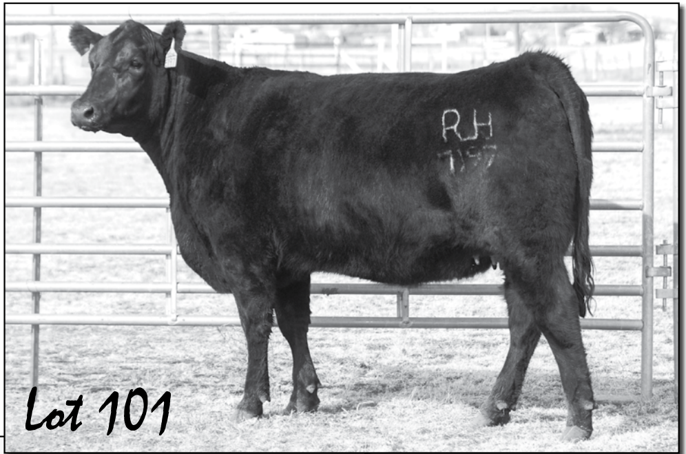
HALES IN SURE E197