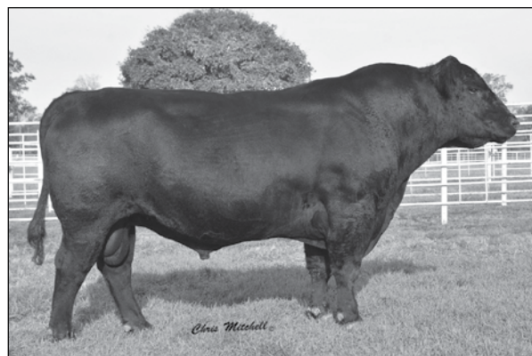
SANDPOINT BUTKUS X797 REFERENCE SIRE

Genomic enhanced EPDs. Due 5-30-19 TO Connealy Comrade 1385 (17031465). PE from 2-11-19 to E073 (19020586). Confirmed bred to AI.