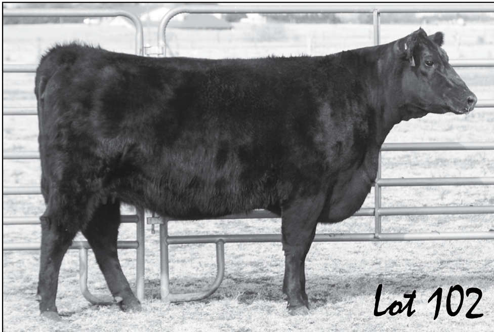
HALES CONSENSUS LADY E128