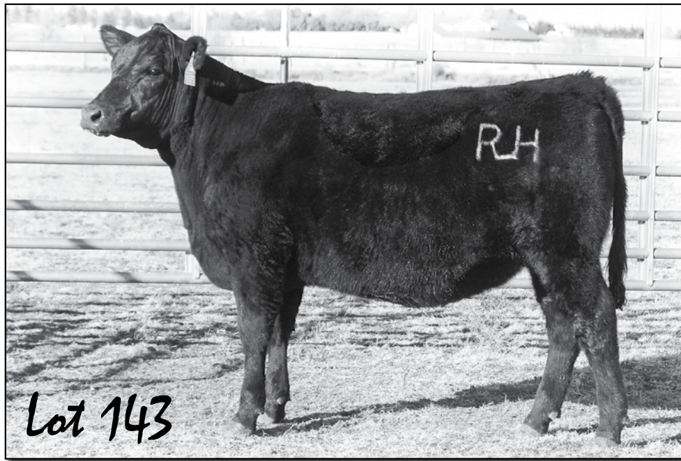
HALES FORTRESS LADY 8036