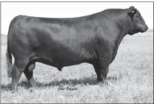
CONNELY CONSENSUS 7229 REFERENCE SIRE