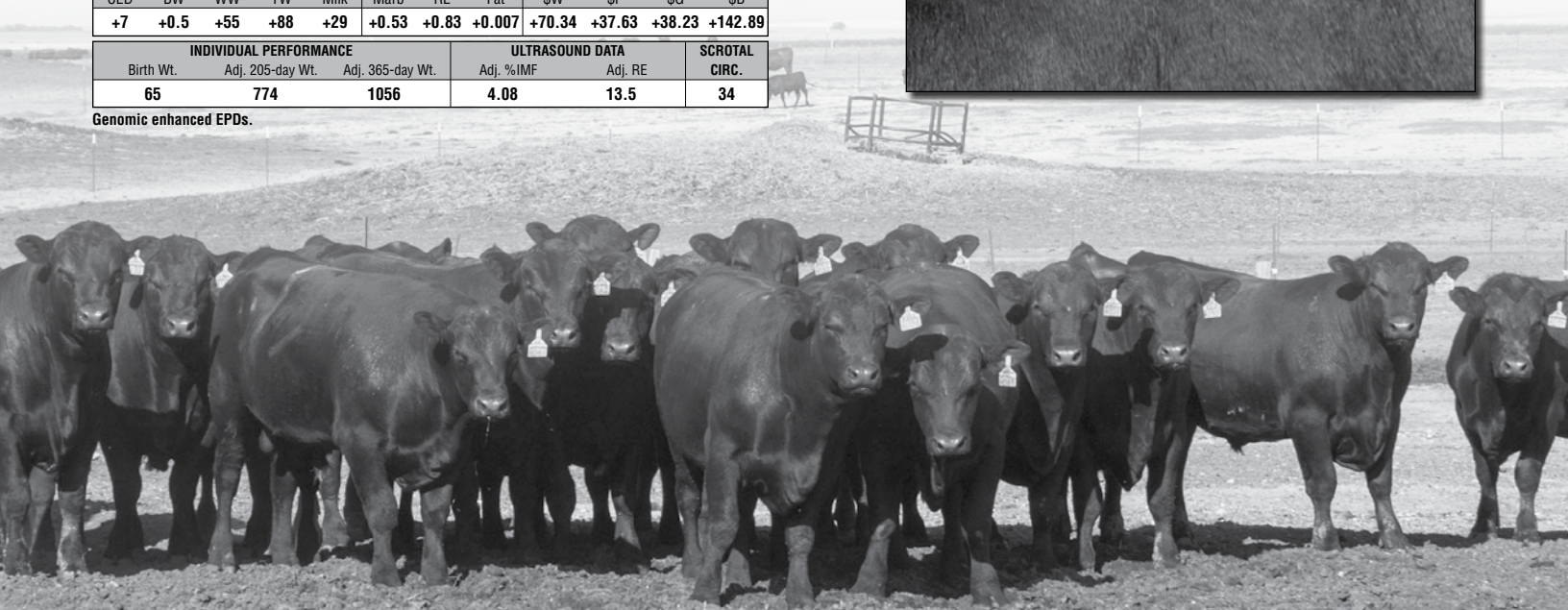
Breed Averages for Non-Parent Bulls