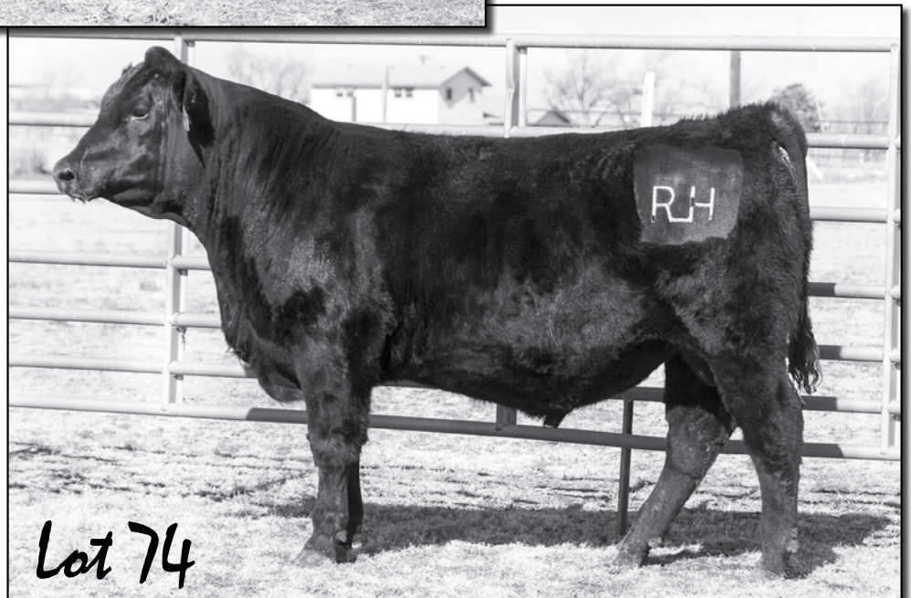
HALES LEUPOLD 8007