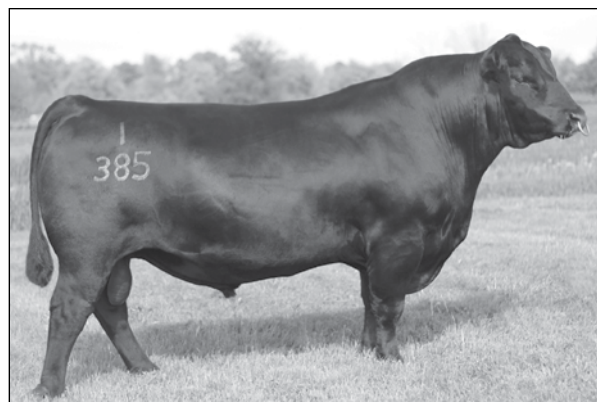
CONNELLY COMRADE 1385 REFERENCE SIRE

Genomic enhanced EPDs. Due 4-26-19 TO G A R Sure Fire (17328461). PE from 2-11-19 to E073 (19020586). Confirmed bred to AI.