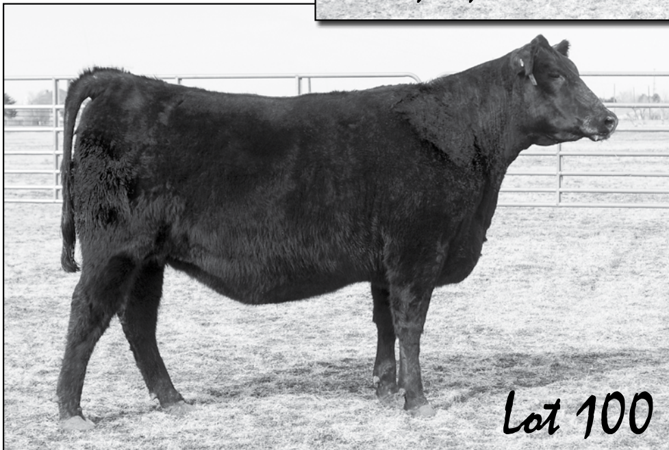
HALES TOP HAND LADY E212