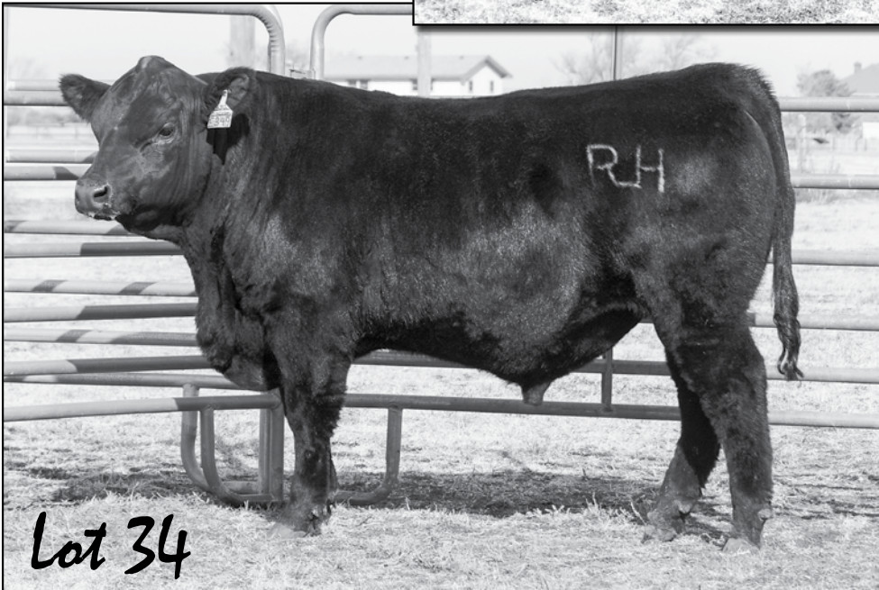
HALES DISCOVERY E349