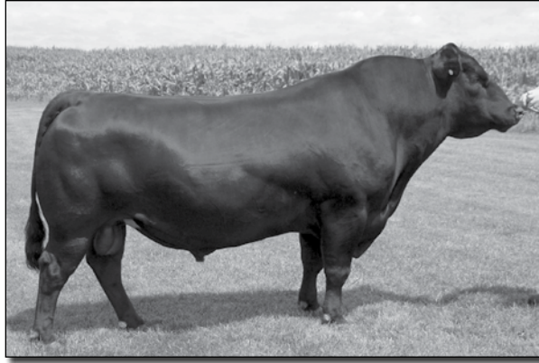
K C F BENNETT ABSOLUTE REFERENCE SIRE