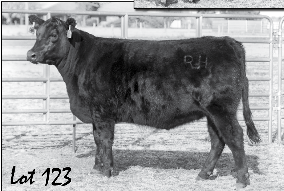
HALES BRONC LADY 7320