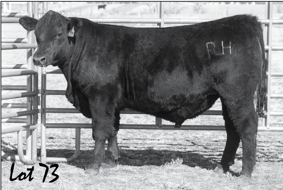
HALES DISCOVER 8077