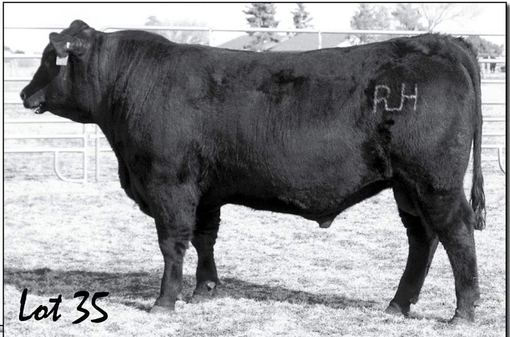
HALES BUTKUS E326