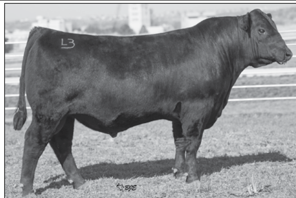
MILL BRAE ENDURANCE 2118 REFERENCE SIRE