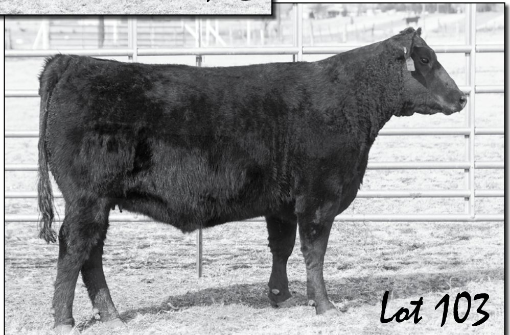
HALES TRAVELER LADY E215