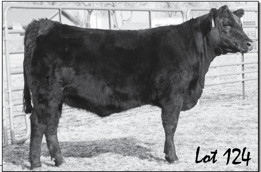
HALES COMBINATION ANNA E357