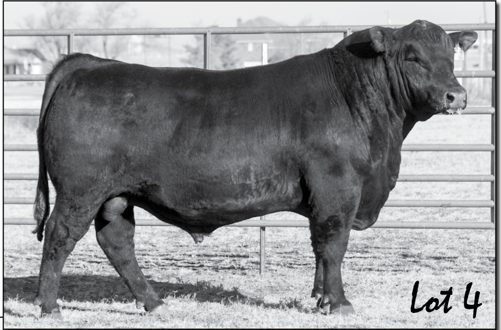
HALES TEN X E136