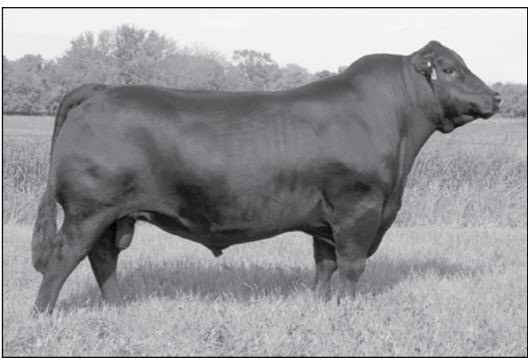
CONNELY COMBINATION 0188 REFERENCE SIRE