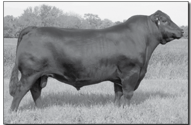
CONNELLY COMBINATION 0188 REFERENCE SIRE