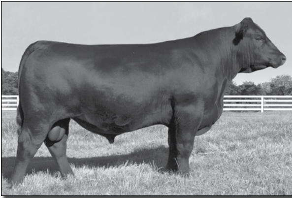
V A R DISCOVERY 2240 REFERENCE SIRE