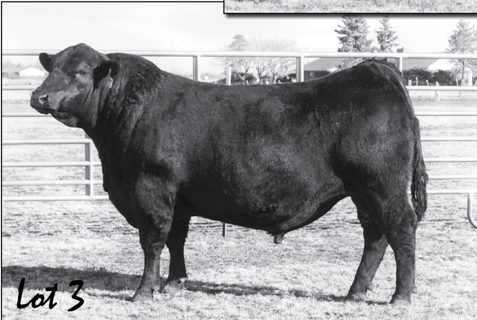
HALES FORTRESS E116