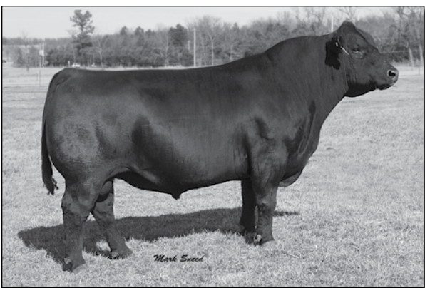
CONNELY IN SURE 8524 REFERENCE SIRE