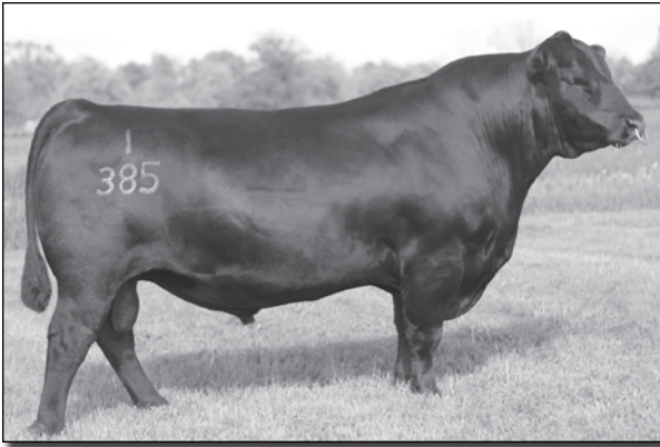
CONNELLY COMRADE 1385 REFERENCE SIRE