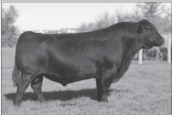
K C F BENNET FORTRESS REFERENCE SIRE

HALES POWER LADY E220 BD: 04/25/17 COW: 19020603 TATTOO: E220 Rito 9M25 of Rita 5F56 Pred G A R Predestined Hales 9M25 Power 4080 Rita 5F56 of 1198 FD 17897309 Mytty In Focus Hales In Focus Lady 8255 Hales 4147 FD Lady 6294 Connealy Consensus 7229 Connealy Consensus Hales Consensus lady 3127 Blue Lilly of Conanga 16 17612406 C A Future Direction 5321 Hales Miss Future Lady 3252 Hales Bright Star 5162