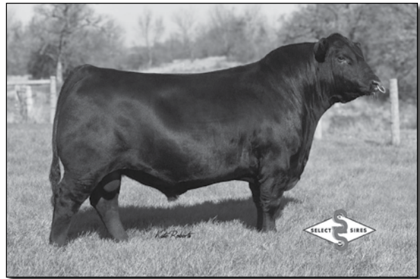
WERNER FLAT TOP 4136 REFERENCE SIRE