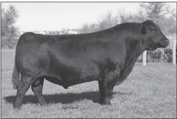
KCF BENNETT FORTRESS REFERENCE SIRE