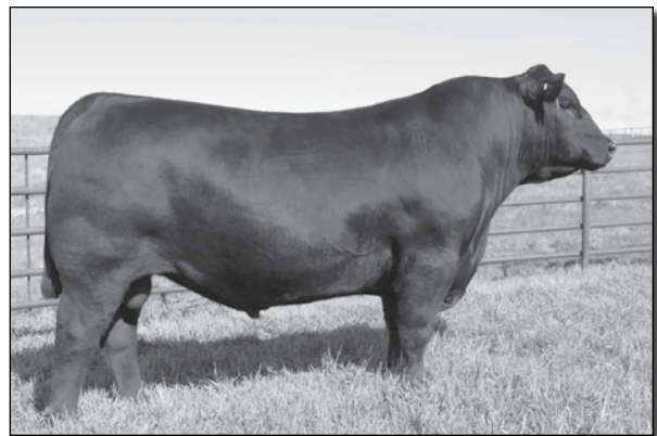
S A V TEN SPEED 3022 REFERENCE SIRE