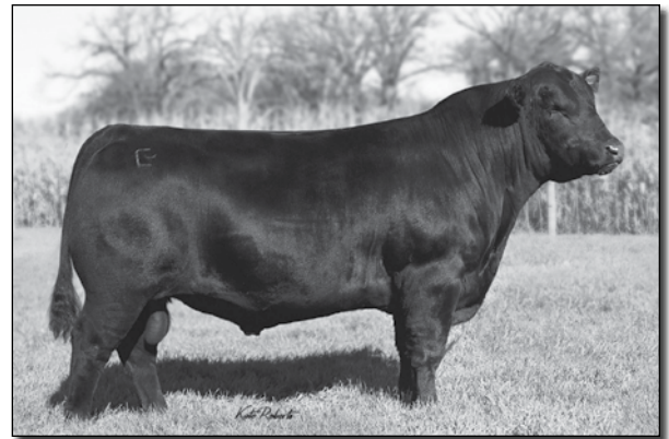
BALDRIDGE BRONC REFERENCE SIRE